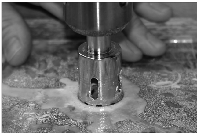
Figure 1. Example of diamond bit drilling hole in glass.

These bits can be used with a handheld drill or drill press. However, we recommend using a drill press whenever possible for greater control and precision (see Figure 1 ).